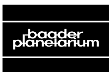
Abbe Barlow lens 2x # 1603321