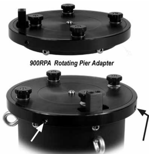
900RPA Rotating Pier Adapter

Note #2: The Rotating Pier Adapter will work best with the Heavy Duty Azimuth Adjuster which is standard on all 900GTO mounts produced after August, 2005 and is available as an upgrade (9AZKIT) to older mounts. See our website for details.