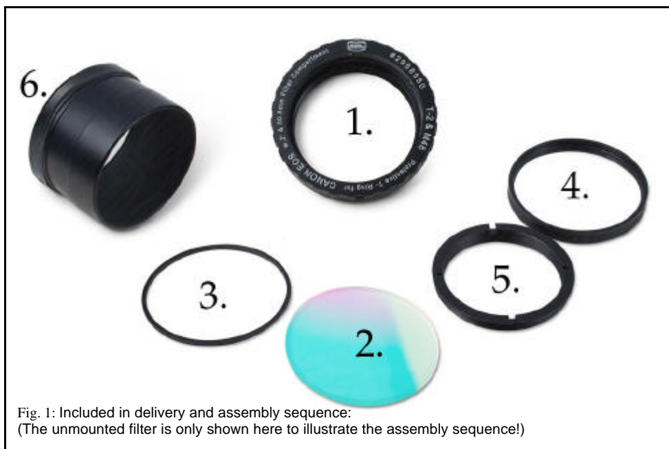
Fig. 1: Included in delivery and assembly sequence: (The unmounted filter is only shown here to illustrate the assembly sequence!)

When supplied with filter, a Baader clear protective 50.8mm filter is built in to the Protective T-ring for the CANON EOS for example. The S52/M48 adapter, as well as the M48/T-2 insert ring, are similarly pre-assembled – however, the M48/T-2 insert ring is only loosely screwed in.