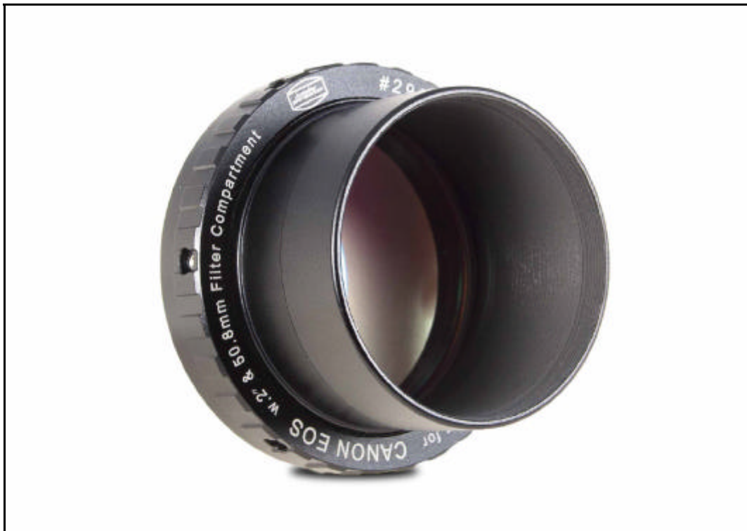
Fig. 3: Illustration: Protective T-Ring for Canon EOS with 2" socket (S52/2")