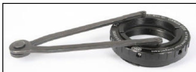
Fig. 8A: Optional, adjustable 2mm face spanner (#2450062)